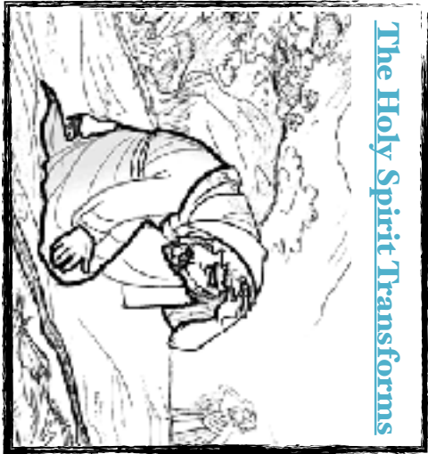
The Holy Spirit Transforms